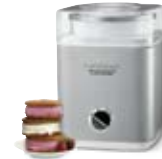
Ice Cream Makers

Cuisinart offers an extensive assortment of top quality products to make life in the kitchen easier than ever. Try some of our other countertop appliances and cookware, and Savor the Good Life®.